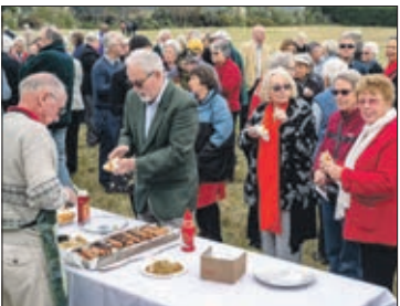
Parishioners and catering after an outdoor Mass at Southwards, Paraparaumu.