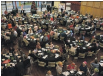
Fundraising dinner for parishioners and friends at Southwards, Paraparaumu.