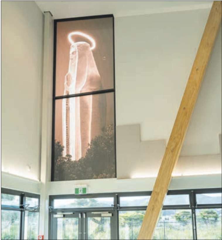
Our Lady of Kāpiti – Te Whaea Tapu o Kāpiti, features in stained-glass windows around the church.