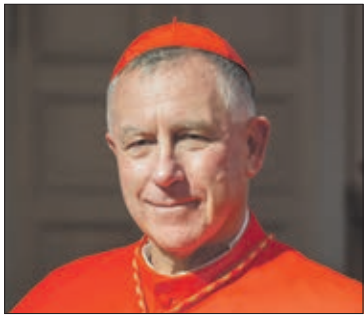
+ JOHN A. CARDINAL DEW ARCHBISHOP OF WELLINGTON

We are privileged to be with Jesus in so many ways – in prayer and in responding to his invitation ‘Remain in my love’ (John 15: 9). If we do not take time or create time to be alone with Jesus in prayer and contemplation, our time when we are together with others in our Christian communities will not bear much fruit. Our personal prayer enhances our prayer as a community and our community prayer enhances our personal prayer. Our places of prayer are essential and important. The new Our Lady of Kāpiti Church is integral to the prayer life of this community and of everyone. The new church will enable us to pray personally and in community. In turn, that prayer will determine how we share the Gospel with society around us, and how we will