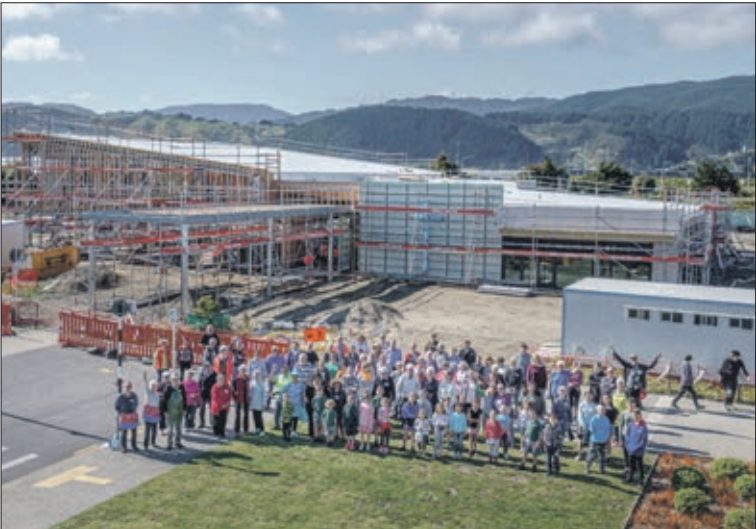
A Sunday congregation assembles outside the new church construction to celebrate the ‘roof shout’ for the roof going on.