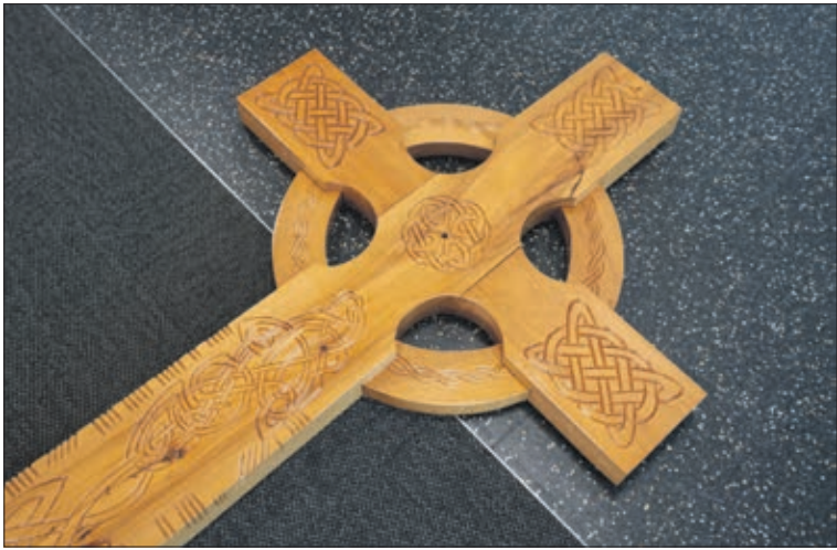
Carved Celtic Cross from Our Lady of Fatima Church, Waikanae, now present in the new church.